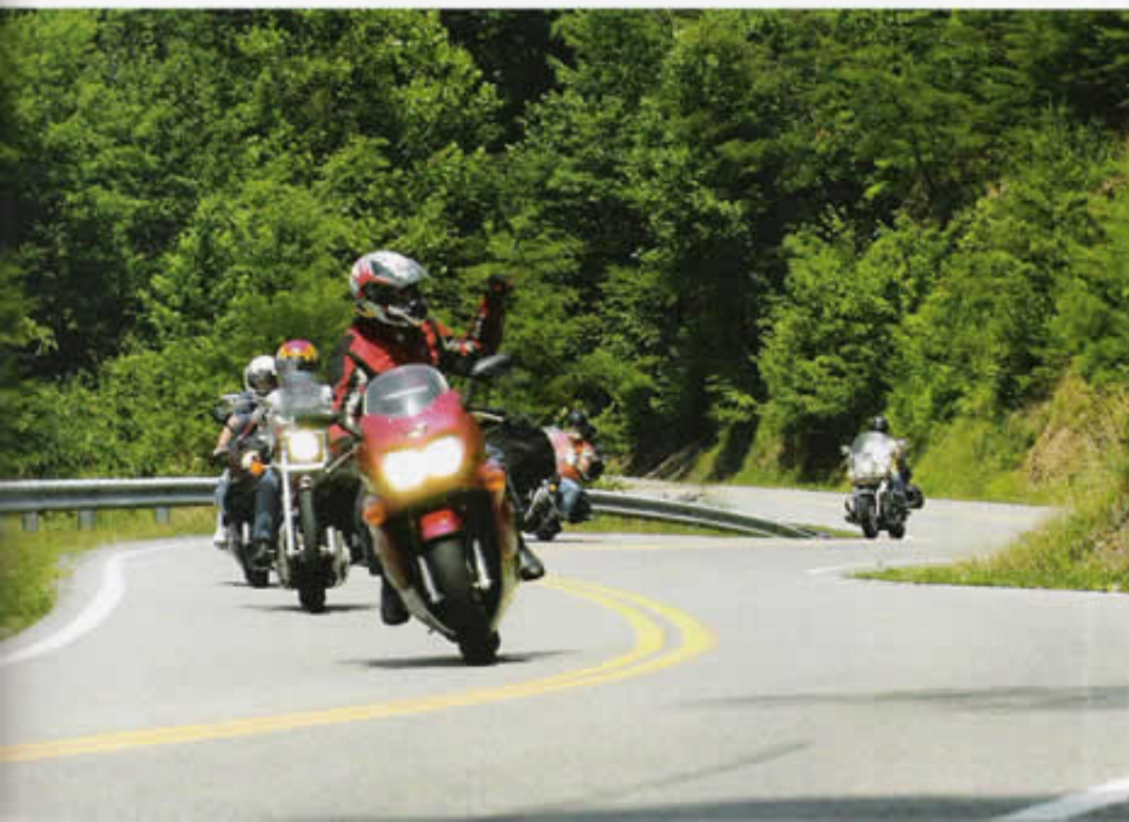
"The Dragon." Honda Hoot bikers take to this Great Smoky Mountains road, a.k.a. U.S. 129.

Circle ad number on card or visit www.blueridgecountry.com